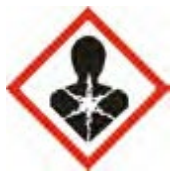
GHS08 Health hazard

Repr. 1B H360 May damage fertility or the unborn child.