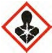
GHS08 Health hazard

Repr. 1B H360 May damage fertility or the unborn child.