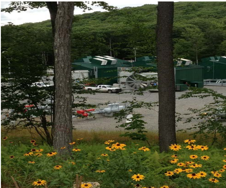
Image 1. Compressor Station.

Color code: dashed purple, natural gas; green, fuel gas; blue, lube oil; orange, muffler