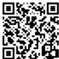
ERG FOR iOS

The ERG can be downloaded onto your mobile device for free at this link or using the QR Codes below: https://www.phmsa.dot.gov/training/hazmat/erg/erg-mobile-app